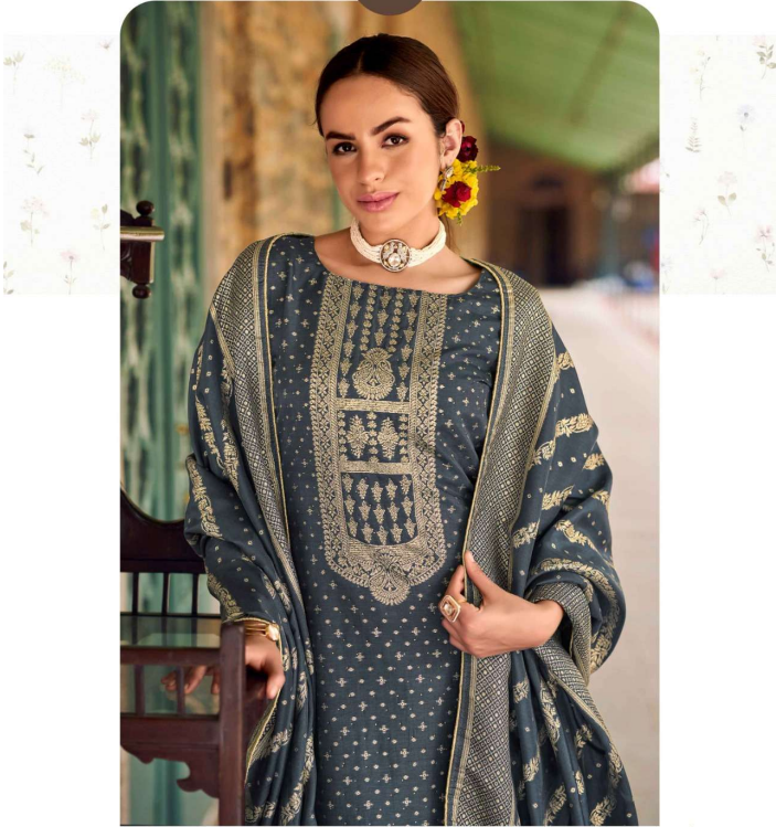
Inspired by history, designed for now. A modern silhouette with an ethnic vow. Fabrics that flow like a river's song. In every dress, the roots stay strong.