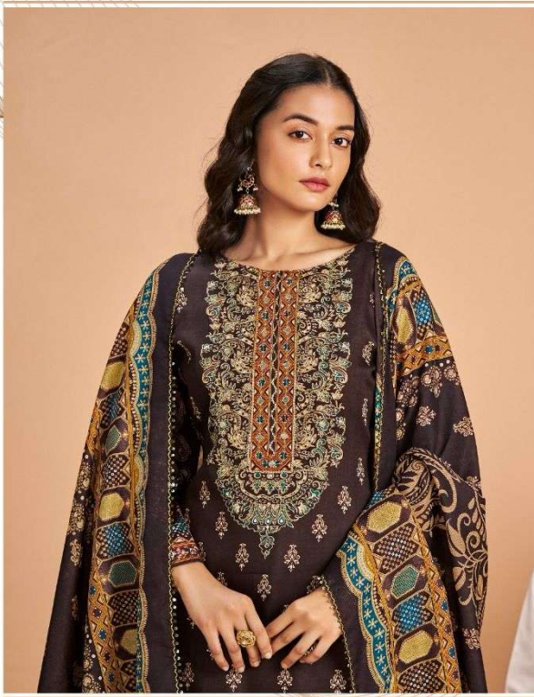
627-005 *This piece is for you personal apparel to the world, especially today when business matters are so tight. Fashion is never business.*