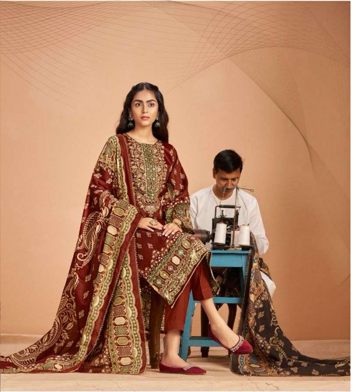
627-004 "What you wear is how you present yourself to the world, especially today, when human contacts are so quick. Fashion is Indian language."