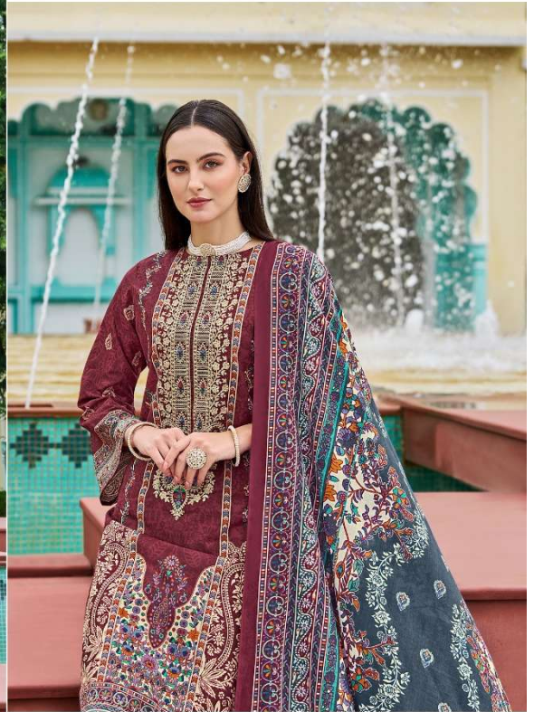
1003-002 "Fashion offers an alternate way of being, crossing and merging masculine and feminine."