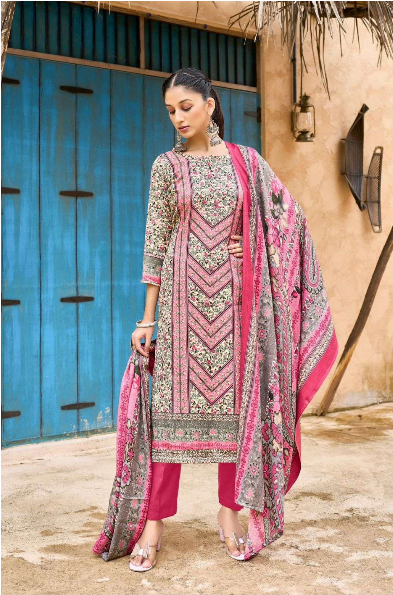
EMBROIDERIES BRINGING TO LIFE GLAMOROUS & INNOVATIVE GARMENT.