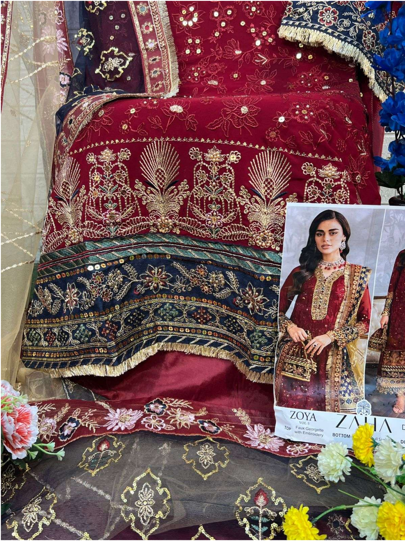
ZOYA VOL-3 TOP Faux Georgette with Embroidery ZAHN BOTTOM- Full Size DI