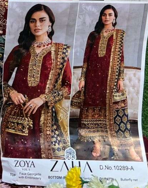
ZOYA VOL. 3 D.No.10289-A TOP Faux Georgette with Embroidery BOTTOM-IT [unclear] [unclear] DUPATTA Butterfly net