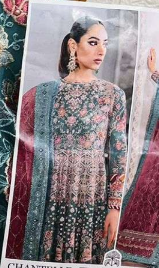
CHANTELLE ZAHA VOL. 5 TOP Butterfly Net with Embroidery BOTTOM INNER Dull Satbon DUPATTA Butterfly Net with Embroidery