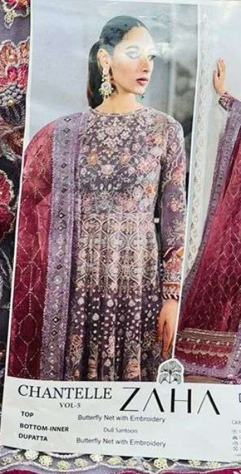
CHANTELLE ZAHA VOL. 5 TOP Butterfly Net with Embroidery BOTTOM-INNER Dull Satin DUPATTA Butterfly Net with Embroidery