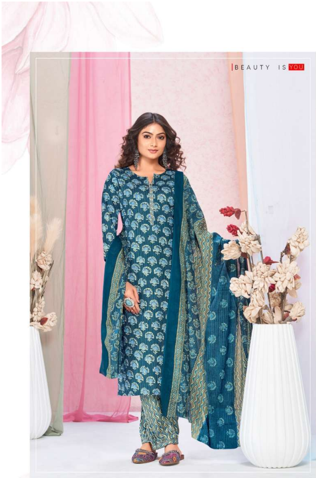
THE COLLECTION WAS A PERFECT BLEND OF INDIAN SILHOUETTES & CONTEMPORARY STYLE NO.3003