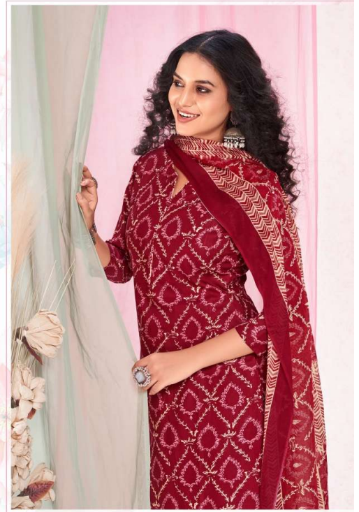
BE BEAUTIFUL WITH THIS MAGNETIC LOOK DESIGN AND MONOTONE COVVECTION. NO. 3006