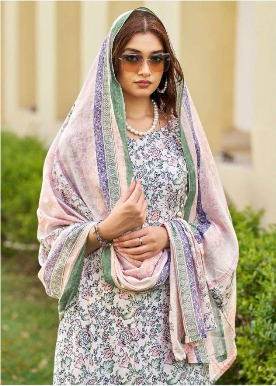
"Where Confidence Meets Glamour, You're Always Gorgeous."