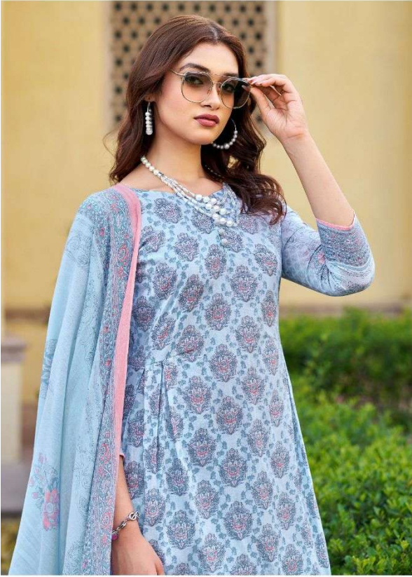
Just as wine ages with care, dresses need meticulous crafting and premium fabrics to express their excellence.