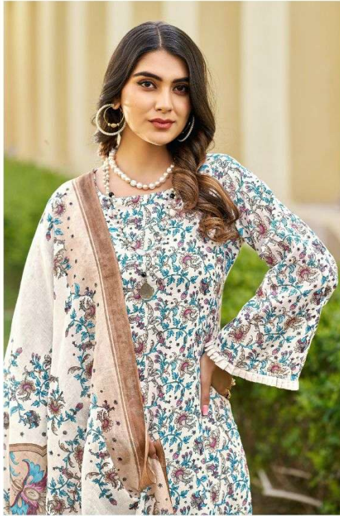
Dresses, resembling wine, require expert craftsmanship and the use of the finest fabrics to reveal their quality.