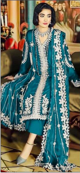
JT D.NO.139 A