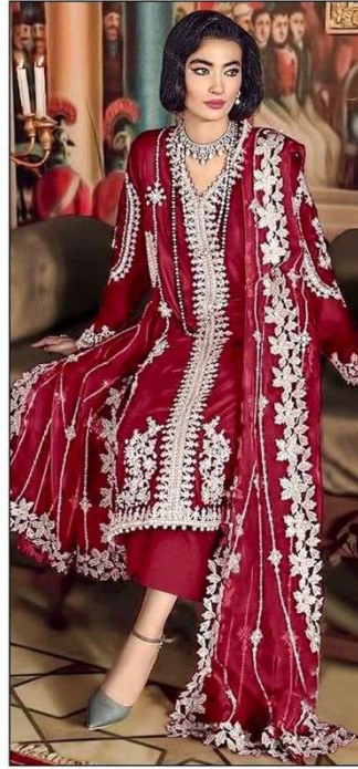
JT D.NO.139 C