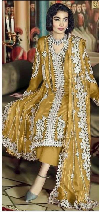
JT D.NO.139 B