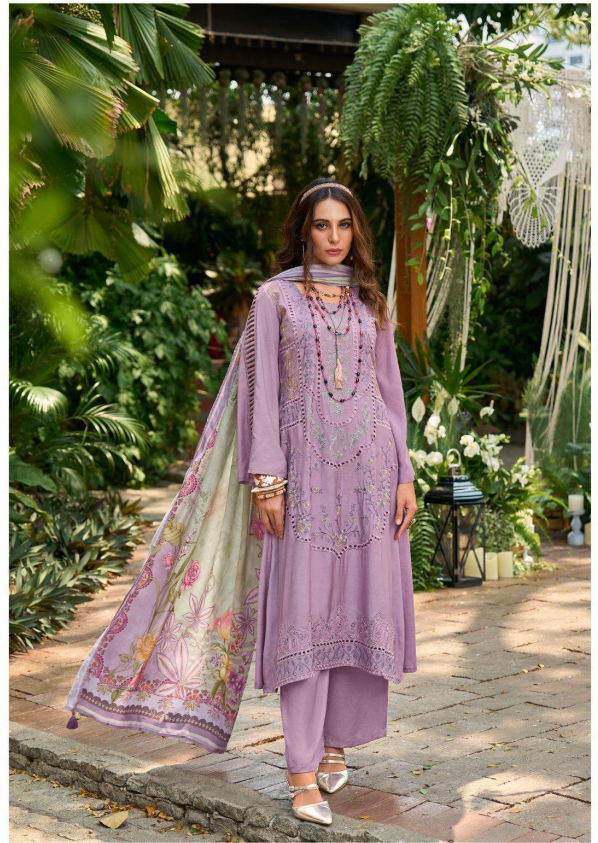
Neishi : 1005