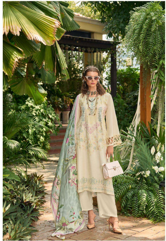
Neishi : 1004