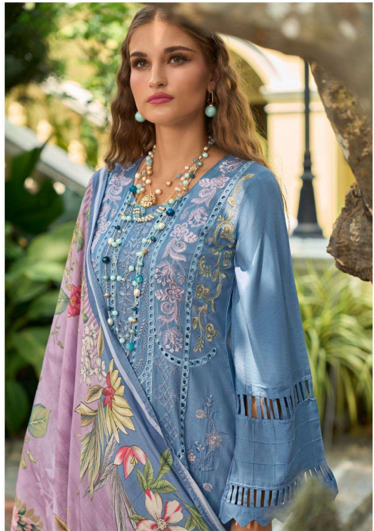
Neishi : 1003