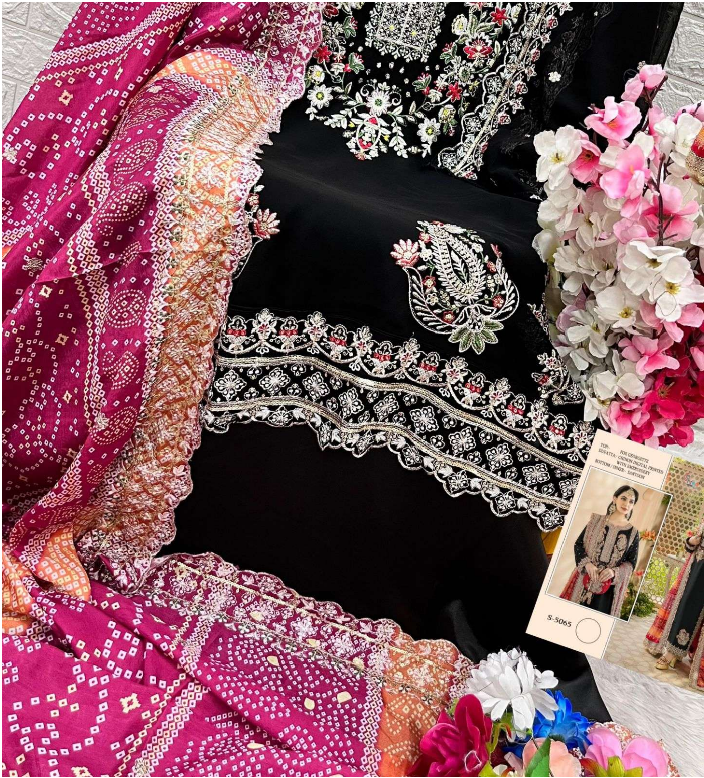
TOP: FOX GEORGETTE CHIMON DIGITAL WITH EMBROIDERY BOTTOM / INNER: SANDOLIN S-5065