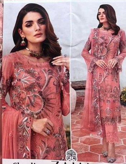
Shezlin ZAHA D.No.1024 TOP Faux Georgette with Embroidery (Cut-2.5 Mtr) BOTTOM INNER Full Santoon DUPATTA Nazim (Cut)