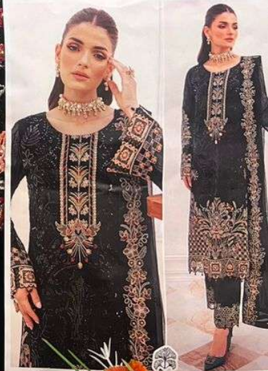
Shezli TOP Faux Georgette with Embroidery (Col: 2) Mtr