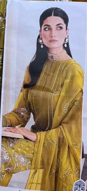
Aabidah VOL-1 ZAH Faux Georgette with TOP Embroidery with hand work BOTTOM-INNER E (Cut-2.5 Mtr.)