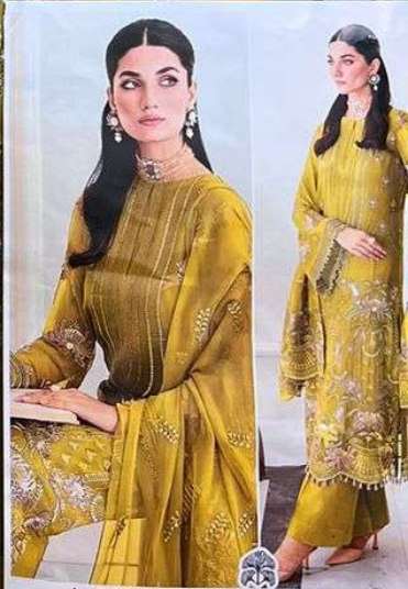
Aabidah VOL1 ZAHA D.No TOP Embroidery with hand work (Cut-2.5 Mtr.) BOTTOM-INNER (Cut-2.5 Mtr.)