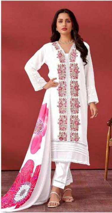
C - 1644