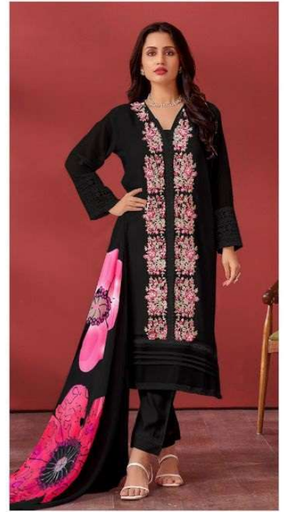
C - 1644 C