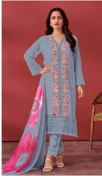
C - 1644 B