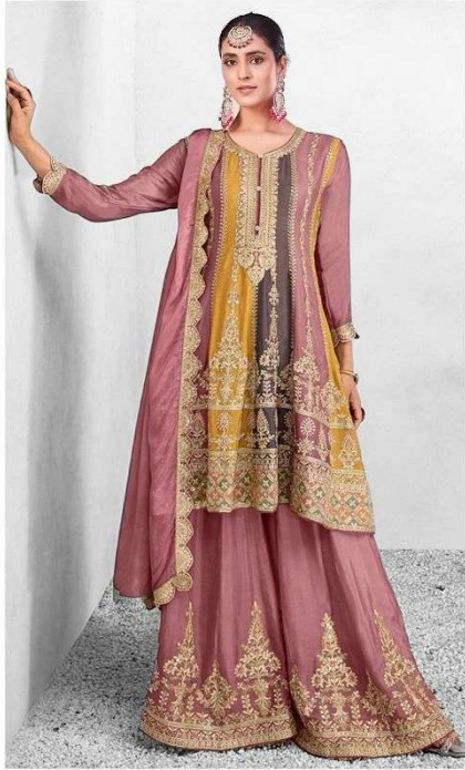
Z7773 D.NO. 438-A