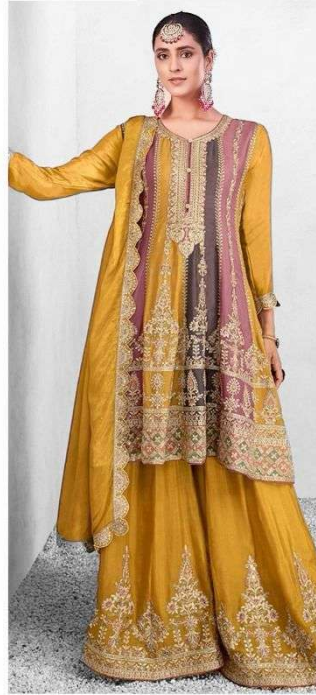
Z7773 D.NO. 438-B