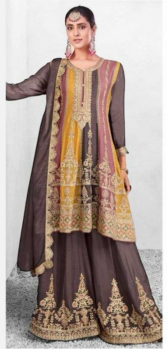
Z7773 D.NO. 438-C