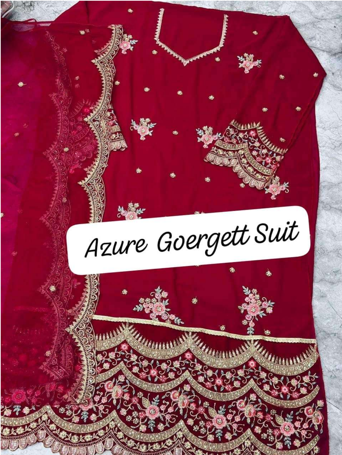
Azure Goergett Suit