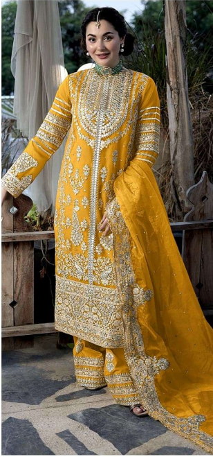
7773 D.No:-203 E

TOP- PURE FOX GEORGETTE WITH HEAVY EMBROIDERY AND SEQUENCE WORK BOTTOM/INNER- DULL SHANTOON WITH HEAVY EMBROIDERY PATCH DUPATTA- PURE FOX GEORGETTE FANCY DUPATTA AND HEAVY EMBROIDERY