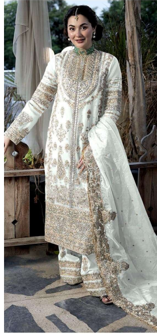
7773 D.No:-203 G