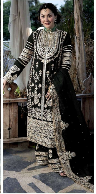
7773 D.No:-203 H