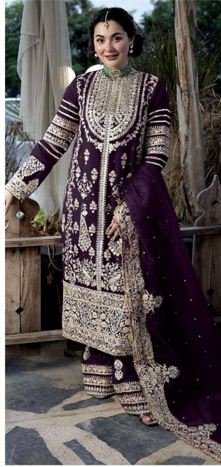
7773 D.No:-203 F