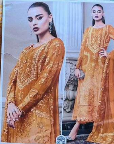
ZAHN D.No.10229 TOP Faux Georgette with Embroidery (Cut-2.5 Mtr.) BOTTOM Faux Georgette with Embroidery (Cut-2.5 Mtr.) DUPATTA Faux Georgette with Embroidery (Cut-2.5 Mtr.)