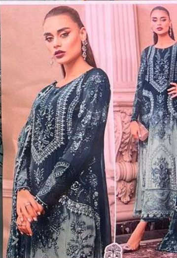
ZAHA D.No TOP Faux Georgette with Embroidery (Cut-2.5 Mtr.) BOTTOM-INNER Dull satin (Cut-4.2 Mtr.) DUP