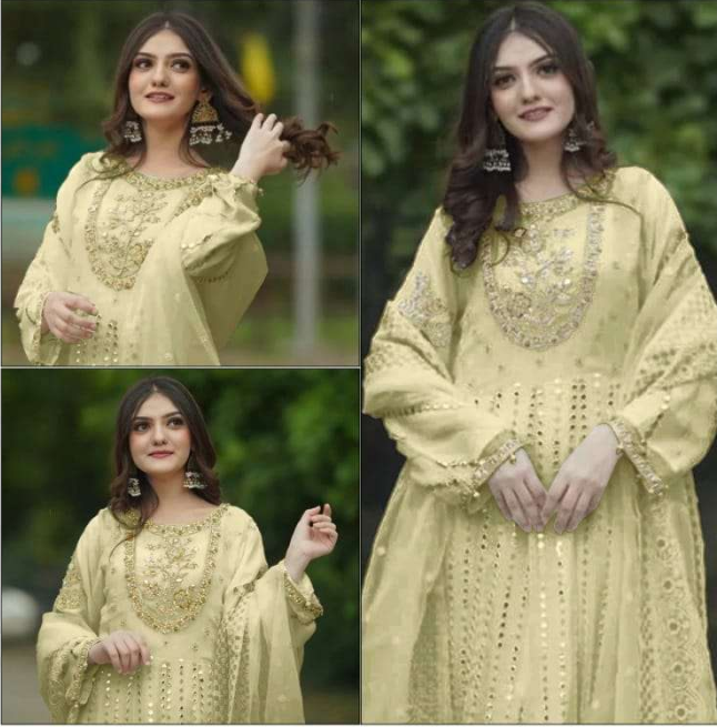
TOP- PURE FOX GEORGETTE WITH HEAVY EMBROIDERY AND SEQUENCE WORK BOTTOMINNER- DULL SHANTOON DUPATTA- PURE GEORGETTE FANCY DUPATTA AND HEAVY EMBROIDERY