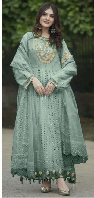
7773 D.No:-264 B