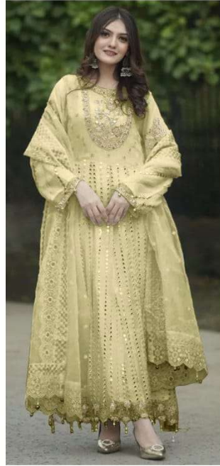
7773 D.No:-264 C