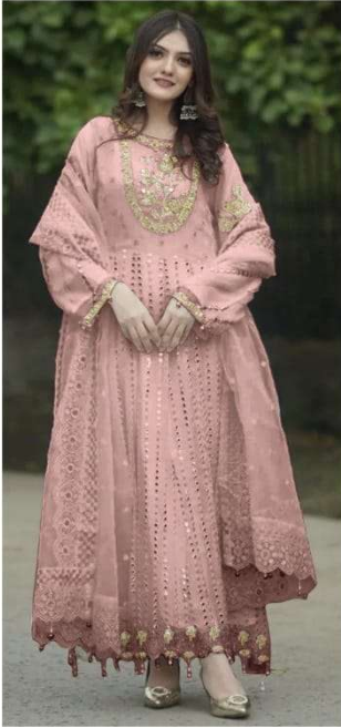
7773 D.No:-264 A

TOP- PURE FOX GEORGETTE WITH HEAVY EMBROIDERY AND SEQUENCE WORK BOTTOM INNER- DULL SHANTOON DUPATTA- PURE GEORGETTE FANCY DUPATTA AND HEAVY EMBROIDERY