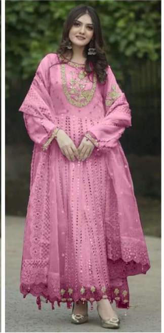
7773 D.No:-264 D