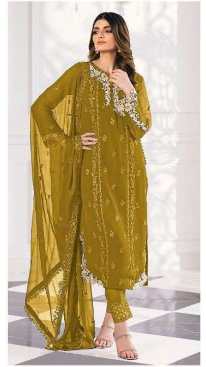
C - 1685 C