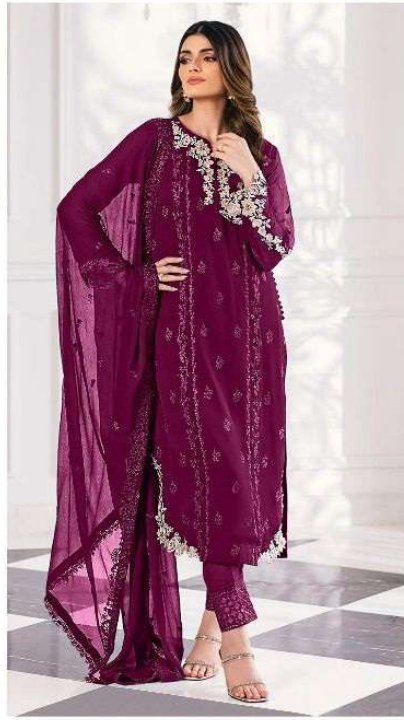
C - 1685 B