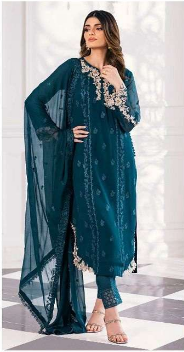
C - 1685