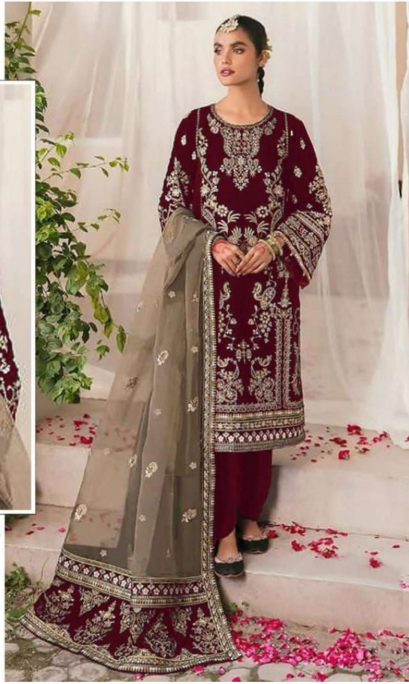
FABRIC DETAILS 1499-D TOP : GEORGETTE DUPATTA : GEORGETTE INNER : SANTOON BOTTOM : SANTOON