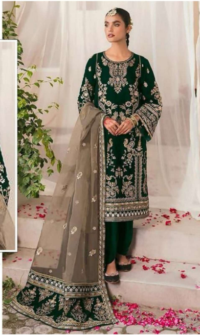
FABRIC DETAILS 1499-A TOP : GEORGETTE DUPATTA : GEORGETTE INNER : SANTOON BOTTOM : SANTOON