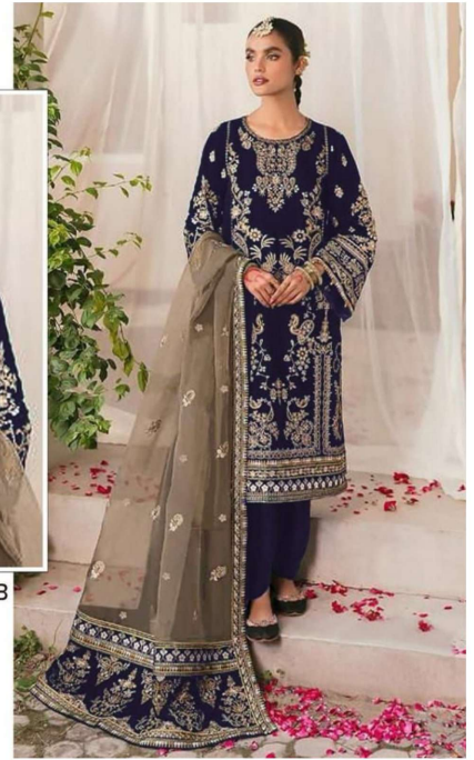
FABRIC DETAILS 1499-B TOP : GEORGETTE DUPATTA : GEORGETTE INNER : SANTOON BOTTOM : SANTOON