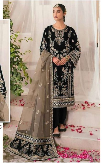
FABRIC DETAILS 1499-C TOP : GEORGETTE DUPATTA : GEORGETTE INNER : SANTOON BOTTOM : SANTOON