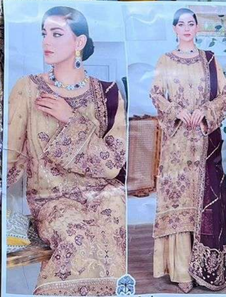
ZAHA D 2228 TOP Faux Georgette with... BOTTOM DULL SANTOON (Cut-4.20 Mtr)