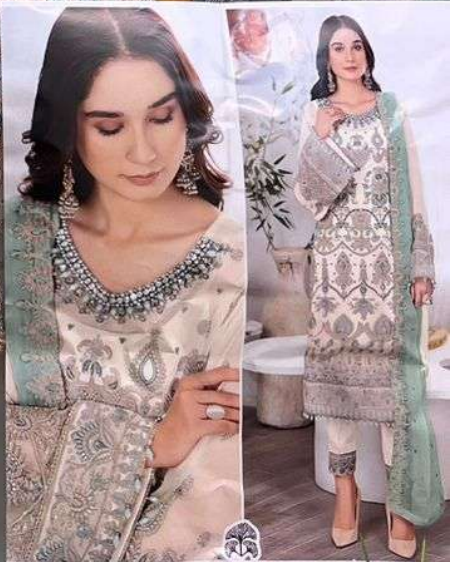
ZAHA D/No.10226 TOP: Faux Georgette with Embroidery (Cut-2.5 Mts) BOTTOM-INNER: Dull tansoon (Cut-4.20 Mts) Mazni Embri 3.5