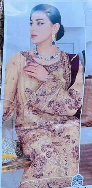
ZAH... TOP Faux Georgette with Embroidery (Cut-2.5) BOTTOM-INNER Dull sa (Cut-4.2)