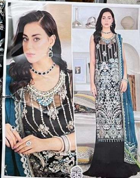
ZAHA D.No. 10227 TOP Faux Georgette With Embroidery (Cut-2.5 Mtr) BOTTOM-INNER Dull satin (Cut-4.20 Mtr)