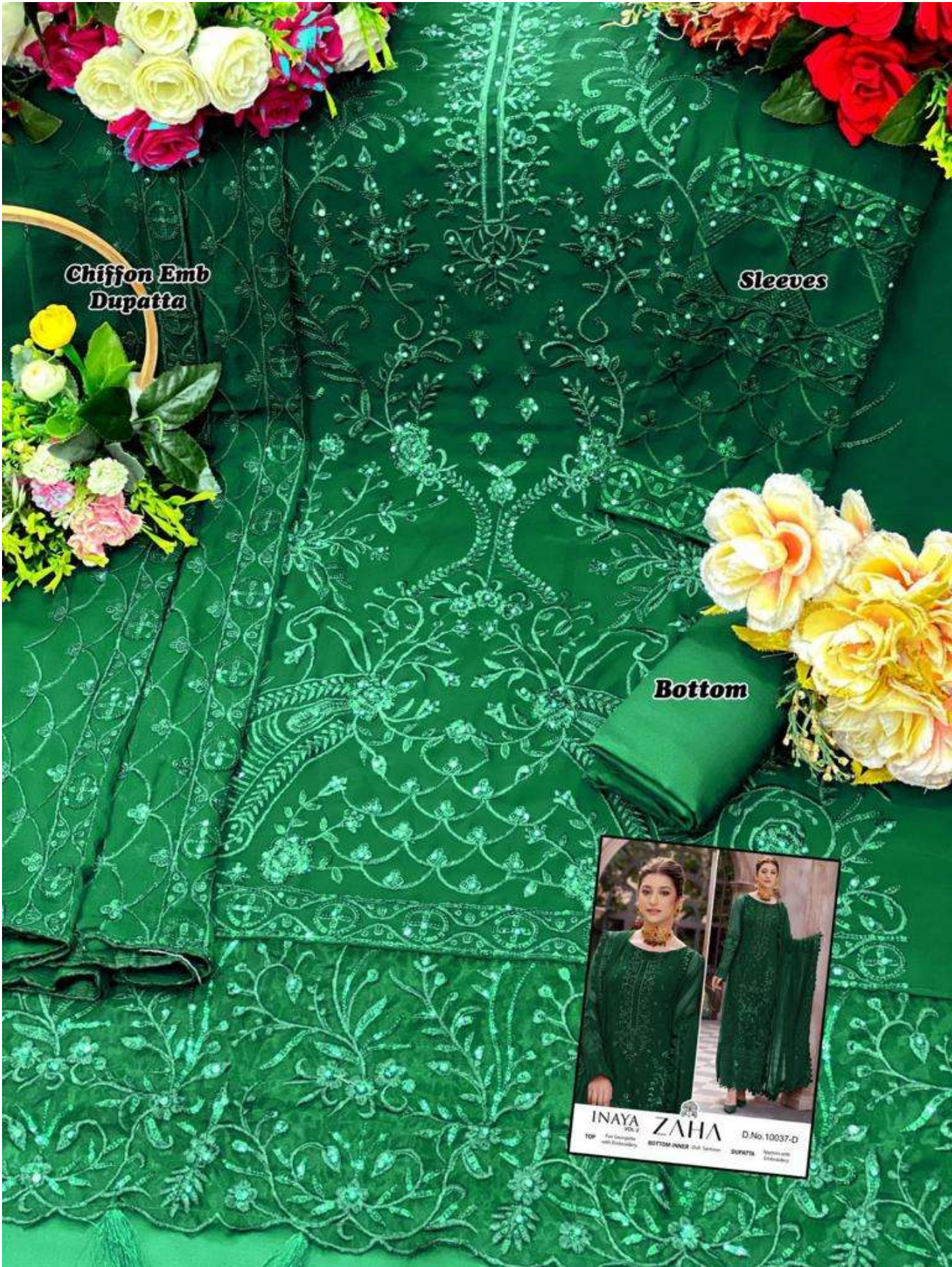
Chiffon Emb Dupatta