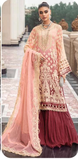
D.No | 237-B