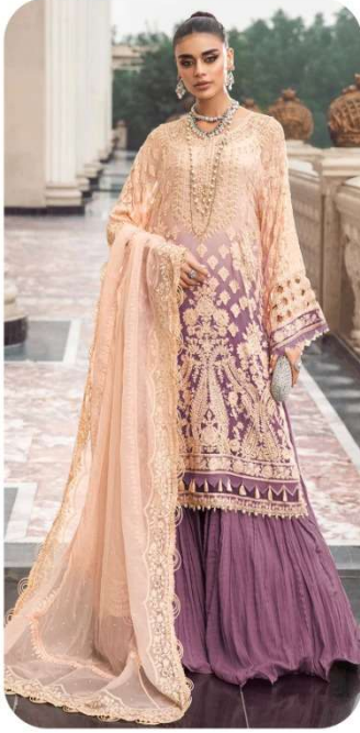
D.No | 237-A