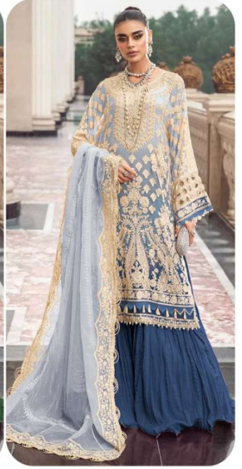
D.No | 237-D