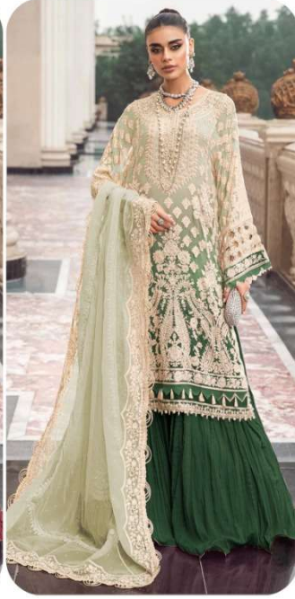
D.No | 237-C