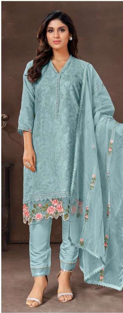
C - 1620 A