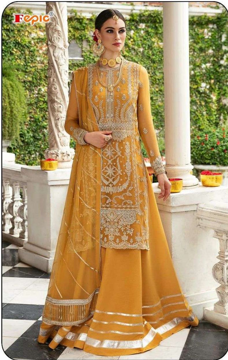
C - 1679