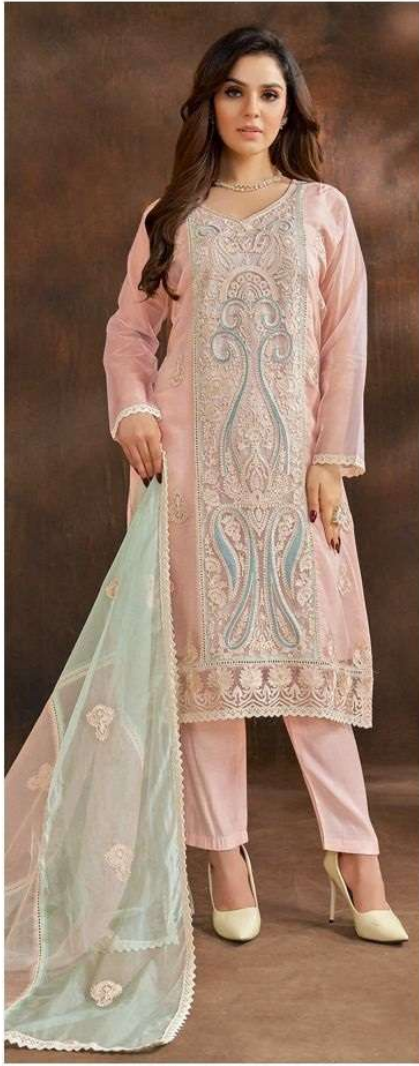
C - 1622