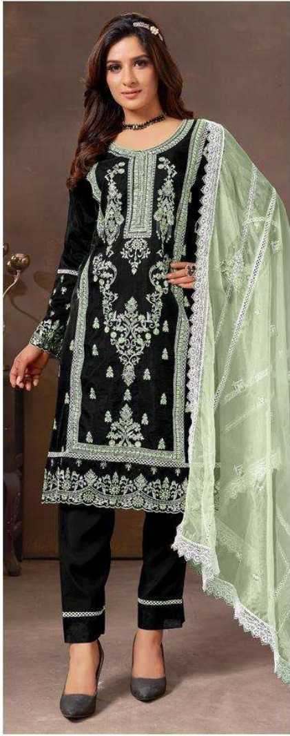
C - 1617 A