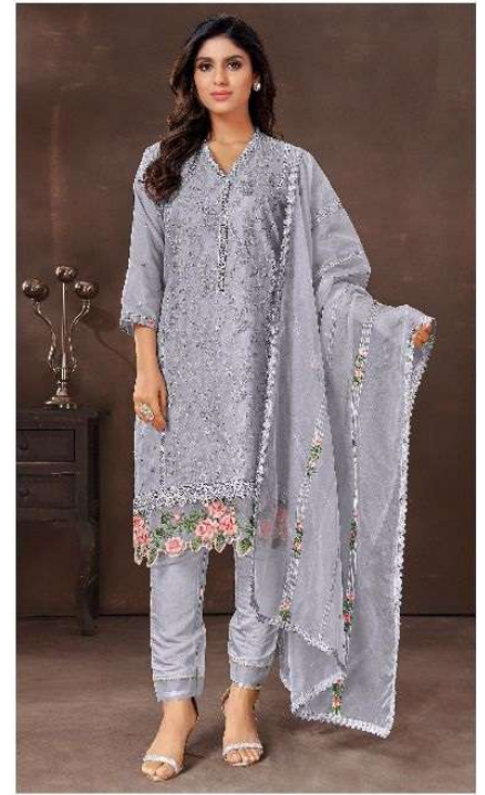
SR - 3020 C