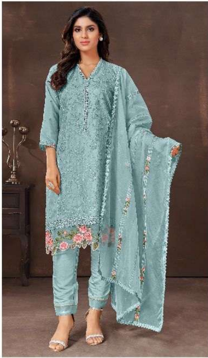
SR - 3020