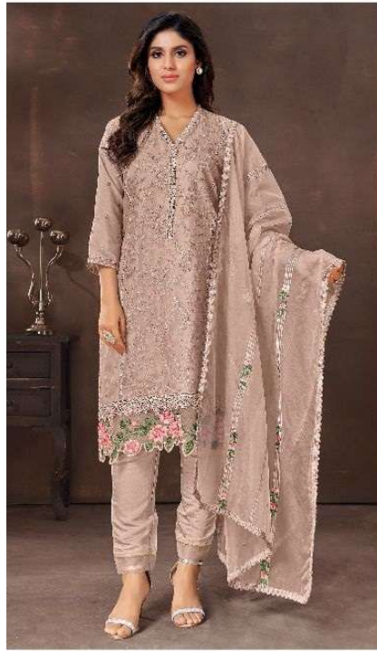
SR - 3020 B