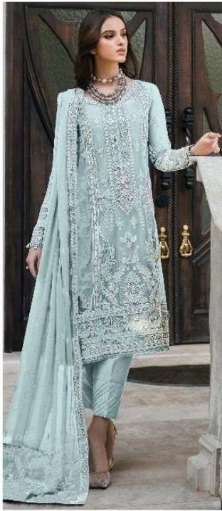
D - 5424 A