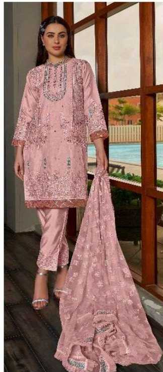
C - 1669 B