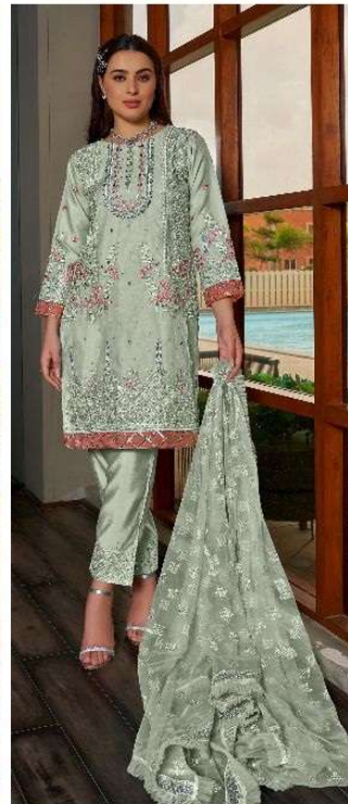
C - 1669 C