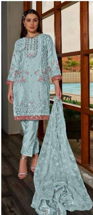
C - 1669