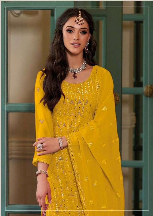
A woman should be two things, classy and fabulous