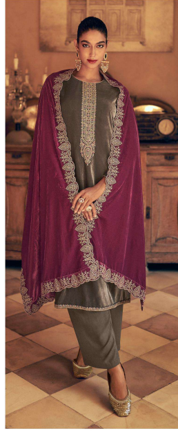
THE VELVET HUB | 50003