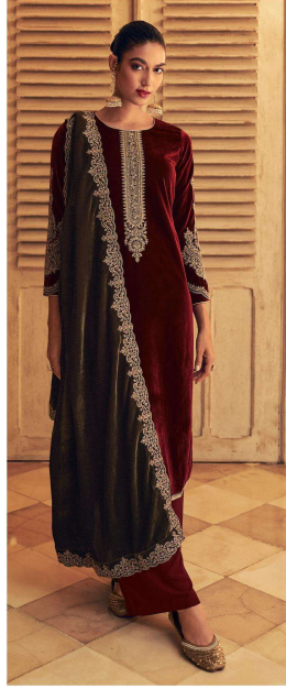
THE VELVET HUB | 50002