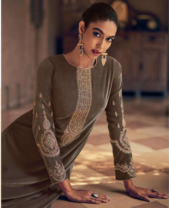
THE VELVET HUB | 50003

منمكز اريش Muntaz Arts Fashion & Lifestyle