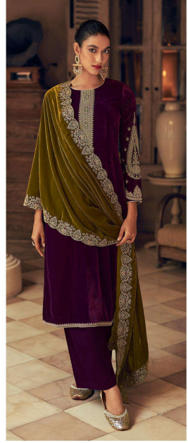
THE VELVET HUB | 50004