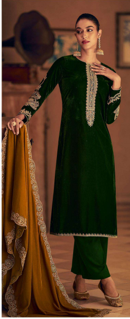
THE VELVET HUB | 50001