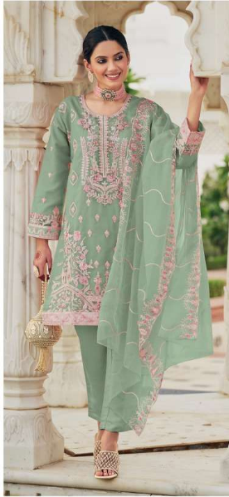
MR -122 C