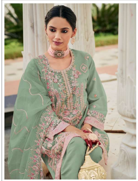
MR -122 C