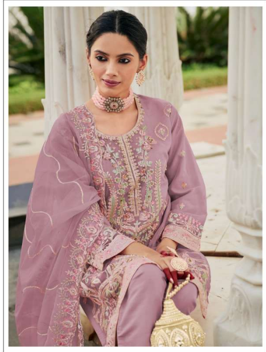
MR -122 D