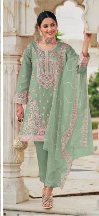
MR -122 C