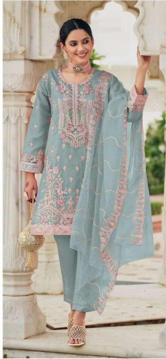
MR -122 B