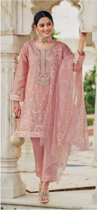
MR -122 A

DUPATTA:- ORGENZA WITH WORK WITH 4SIDE CUT WORK LACE