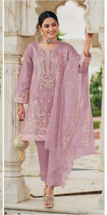
MR -122 D