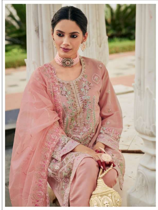
MR -122 A