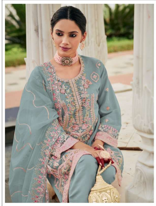
MR -122 B