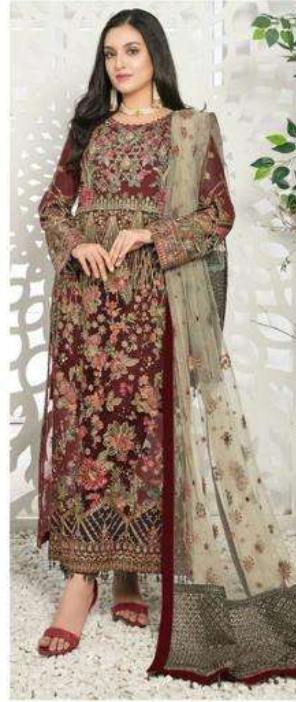
D.NO. - 4002