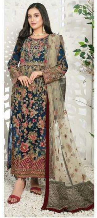
D.NO. - 4003