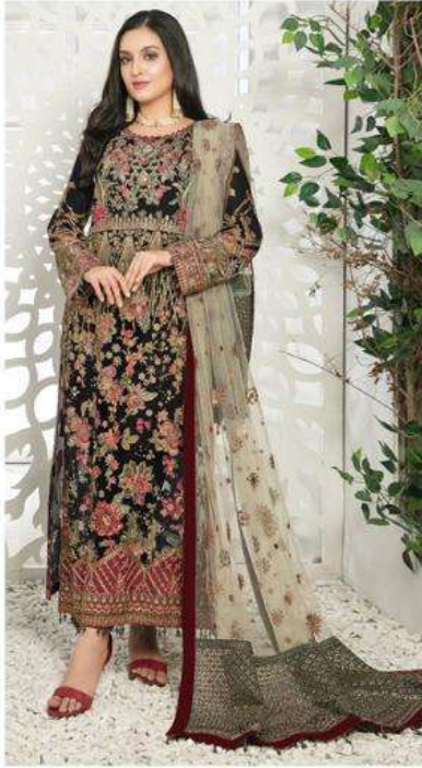
D.NO. - 4001