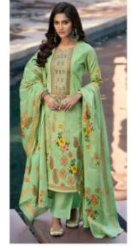
// 9010 //