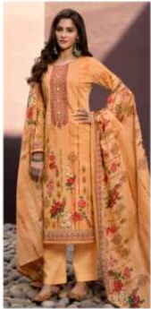
// 9004 //