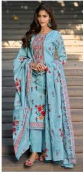
// 9005 //