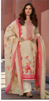
// 9002 //