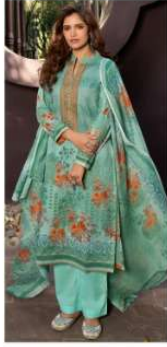
// 9003 //