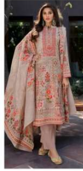
// 9007 //