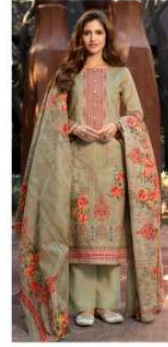
// 9009 //