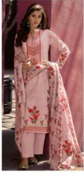
// 9001 //