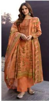
// 9006 //

MUMTAZ ARTS® Pigeon de design परिणीता COLLECTION 2021