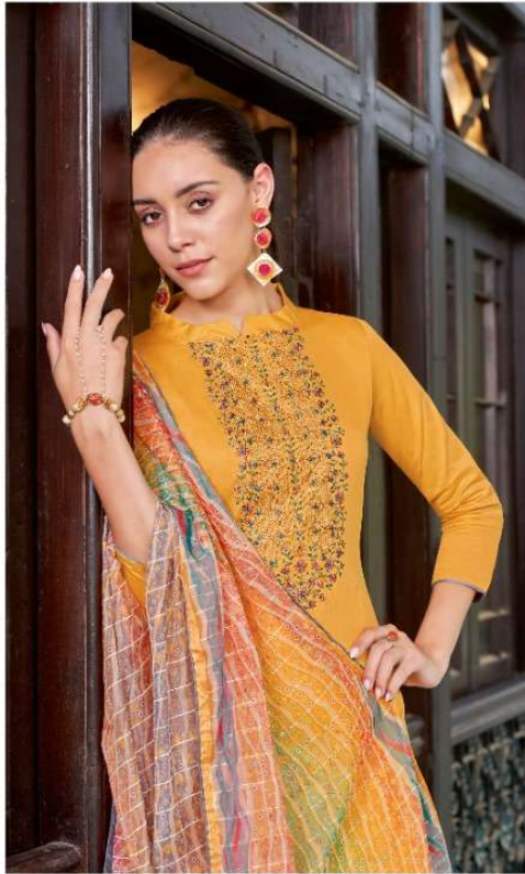
yes, elegance and style is always an integrated part of village attire, and when you adopt such style, you feel a sense of elegance and spirit of look.