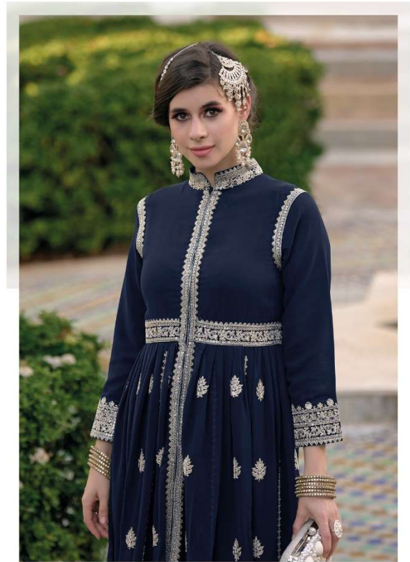
The difference between style and fashion is quality.