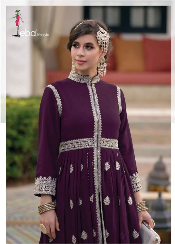
When a person is in fashion, all they do is right.