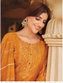
A round up of the hottest trends this spring season you the show ways to wear pantsah patah