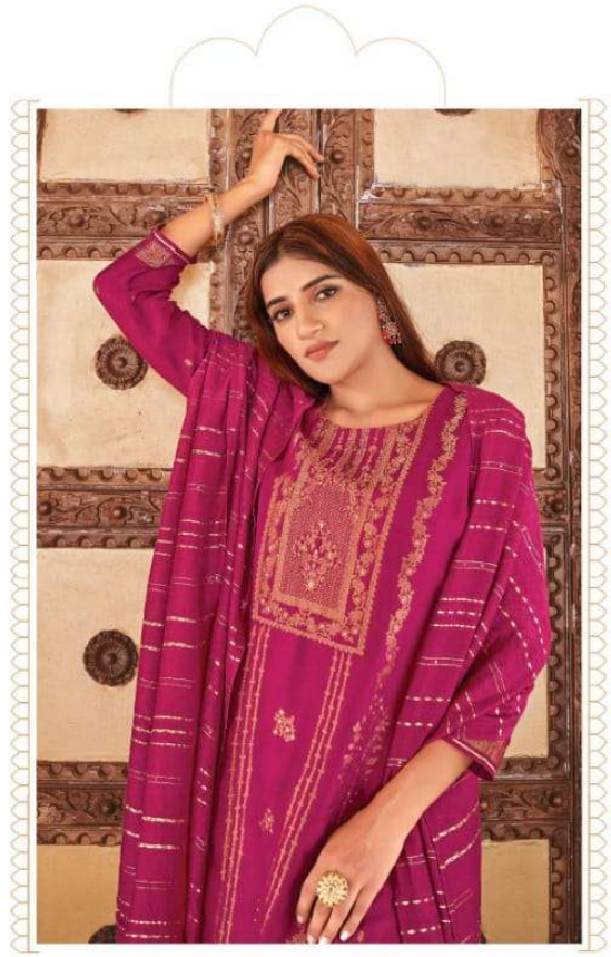
like shisha bold patterns & sumptuous detailing adorns modern silhouette