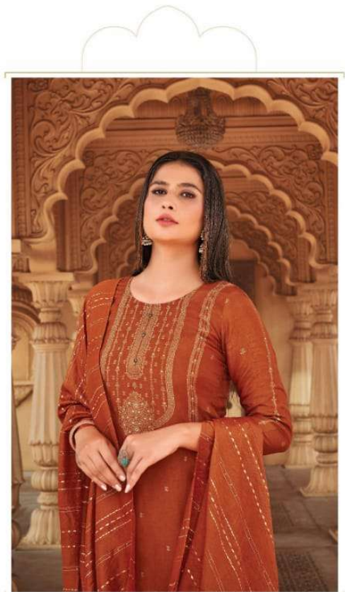
Classic style with luxurious softness highlighted by refined and feminine details